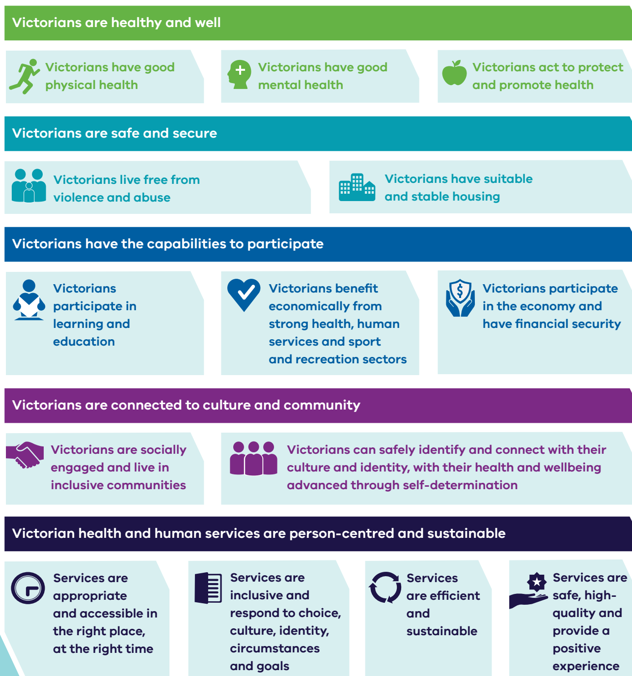
Figure 2: Department of Health and Human Services outcomes framework