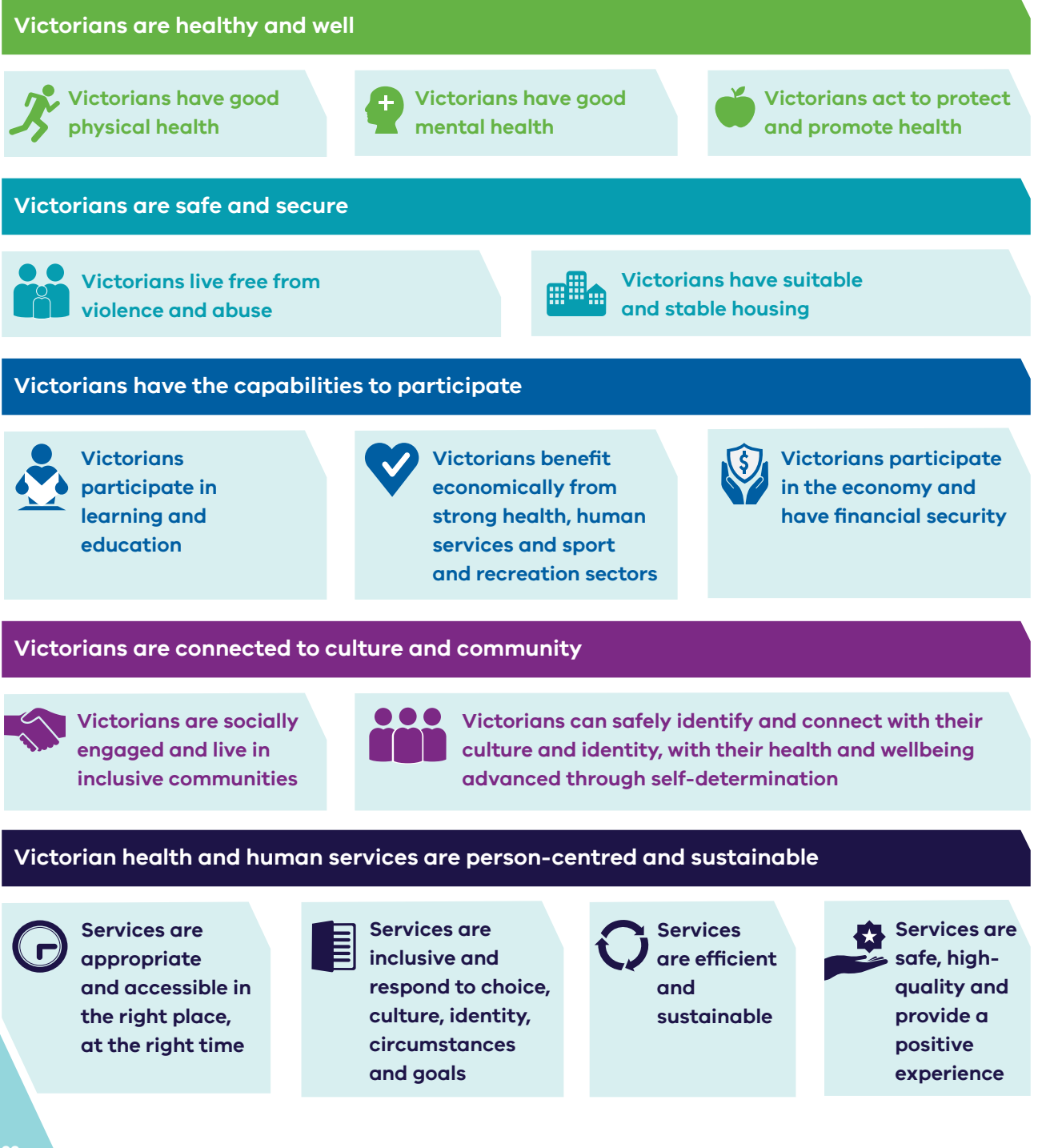
Figure 2: Department of Health and Human Services outcomes framework